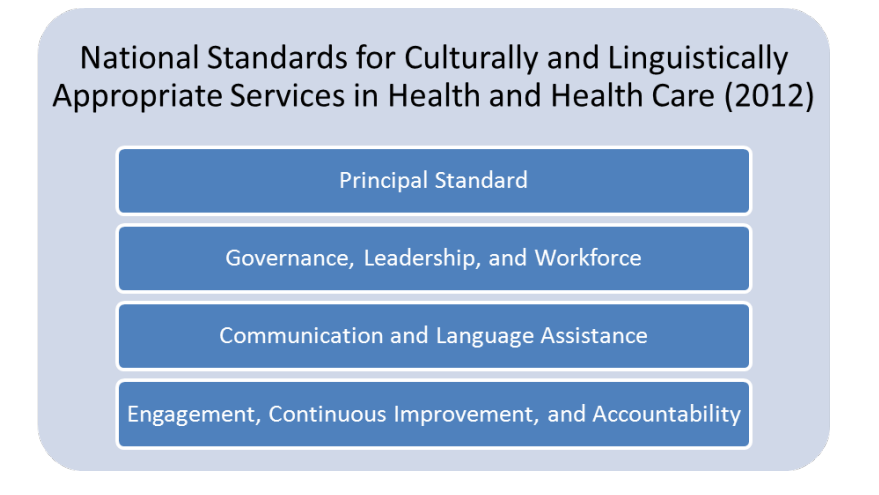
Figure 3: Enhanced National CLAS Standards' Themes

The names of the three themes have been updated both to clarify intent and to broaden the scope of their interpretation and application.