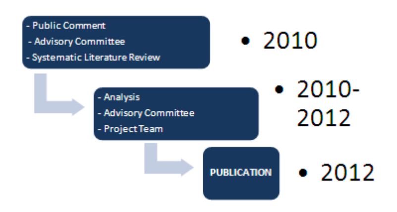
Figure 4: Phases of the National CLAS Standards Enhancement Initiative

Discussions began in 2009 at the HHS Office of Minority Health regarding a plan to enhance the National CLAS Standards. The National CLAS Standards Enhancement Initiative formally began in 2010 following the same development process as the original National CLAS Standards project in 1999–2001. The development process had three major components: public comment, the Advisory Committee, and a systematic literature review.